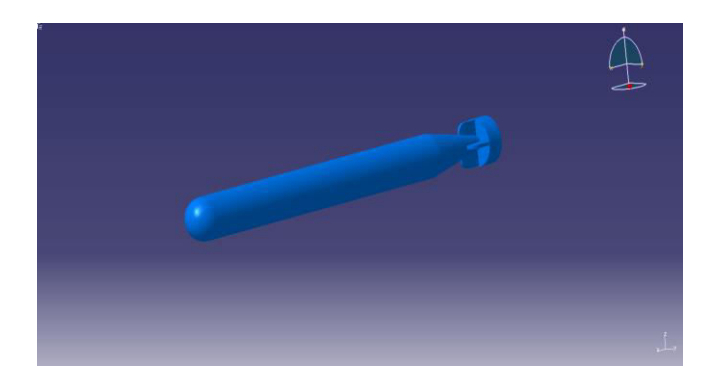
Fig 2: Outer shell design in CATIA V5

The outer shell is designed with hollow head to accommodate the drone that had already been fabricated. The model of the outer shell was created using CATIA V5. Based on this model, a prototype has been built.